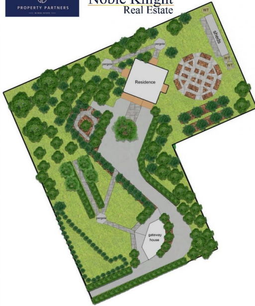
*The plan is for illustrative purposes only. Floor area is living space All details to be confirmed on site.